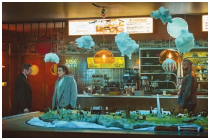
Mr. World (Crispin Glover), Mr. Wednesday (Ian McShane), and Shadow Moon (Ricky Whittle) in the diner situated at Motel America St. Louis.