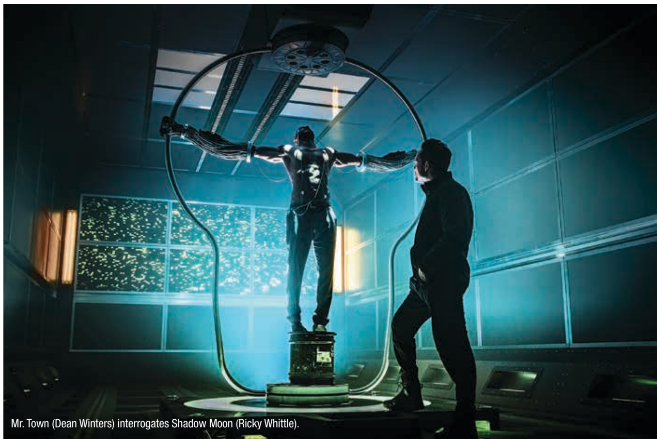
Mr. Town (Dean Winters) interrogates Shadow Moon (Ricky Whittle).