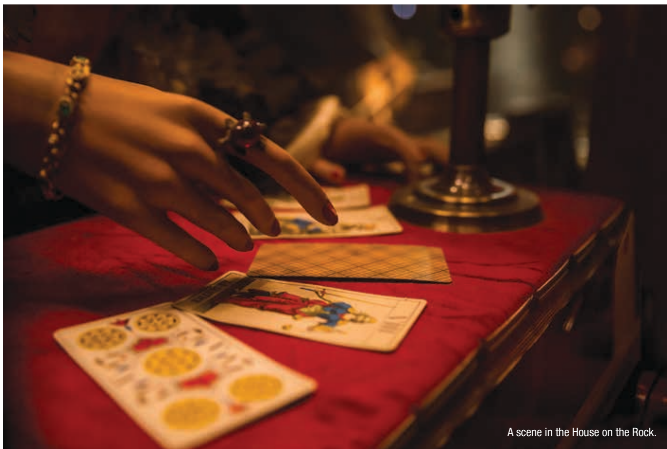
A scene in the House on the Rock.