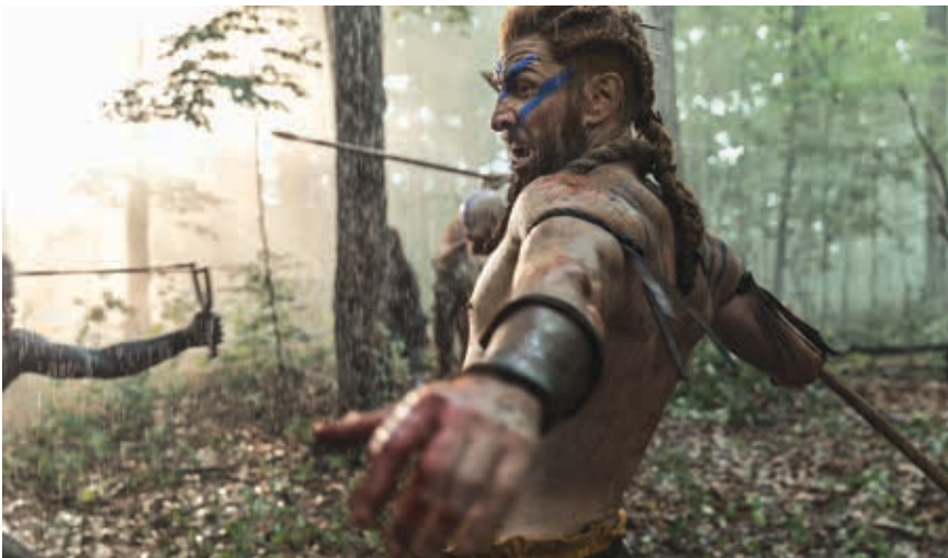
A flashback to a battlefield in Ireland featuring Mad Sweeney (Pablo Schreiber).