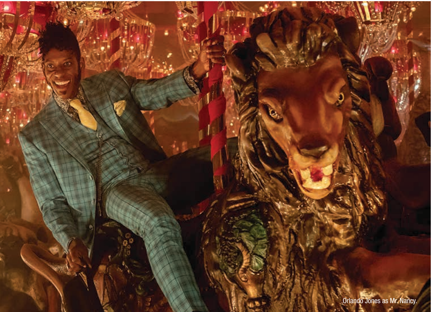
Orlando Jones as Mr. Nancy.

ing people trying to get them onboard. This is also, I would argue, a drug trip. One of the key things that I try to keep in mind as we make the show is the question: Did Shadow get out of jail and fall in with gods or drug addicts?"